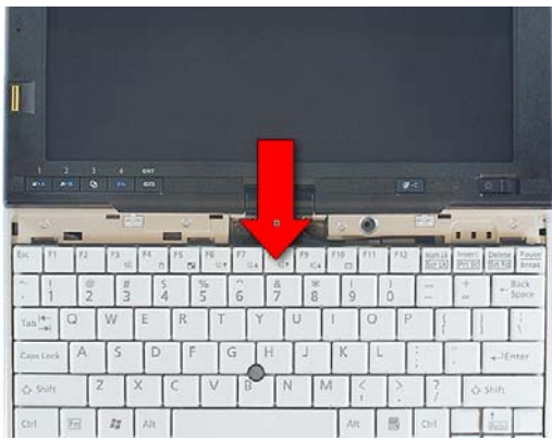
5. Lift the top edge of the keyboard up and turn it over