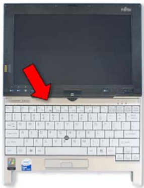
9. Press the keyboard upper trim into place.