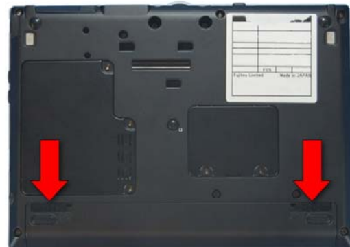
12. Replace the battery.