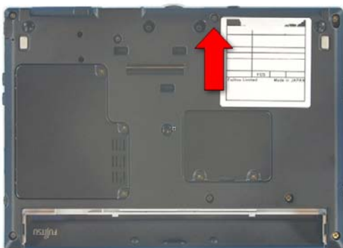
11. Replace the screw