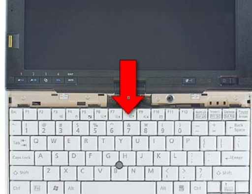
8. Turn the keyboard over and slide it into place