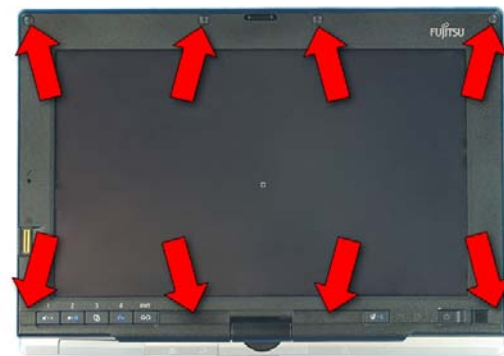
4. Remove 8 screw covers from the front of the display.