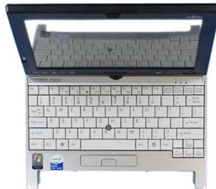
2. Turn the LifeBook back over and open the display