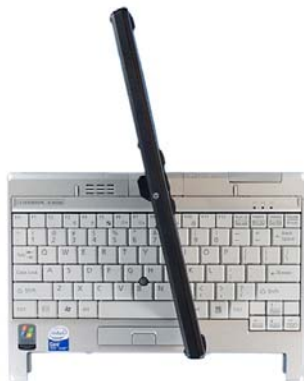
3. Turn the display around and lay it back down.